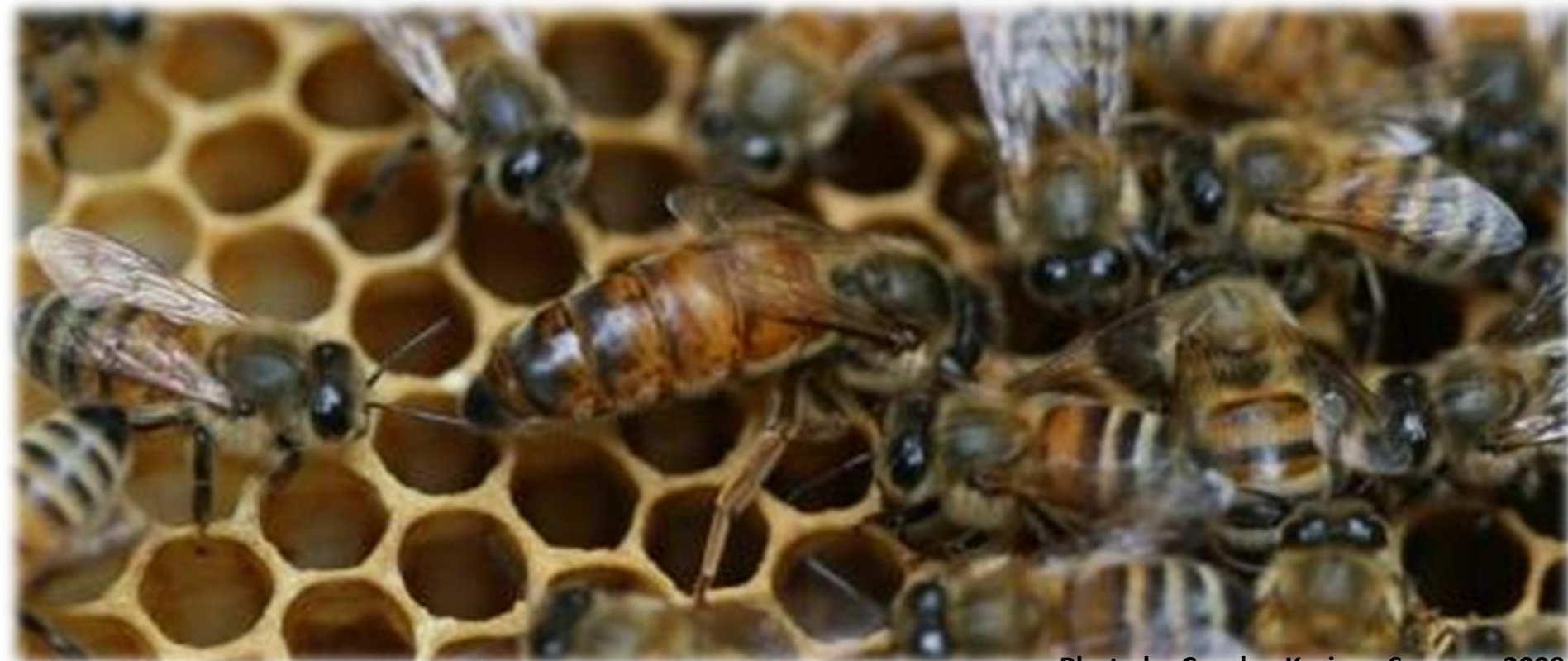
Summer 2009

Indiana Beekeepers Association Annual Fall Conference November 6-7, 2009