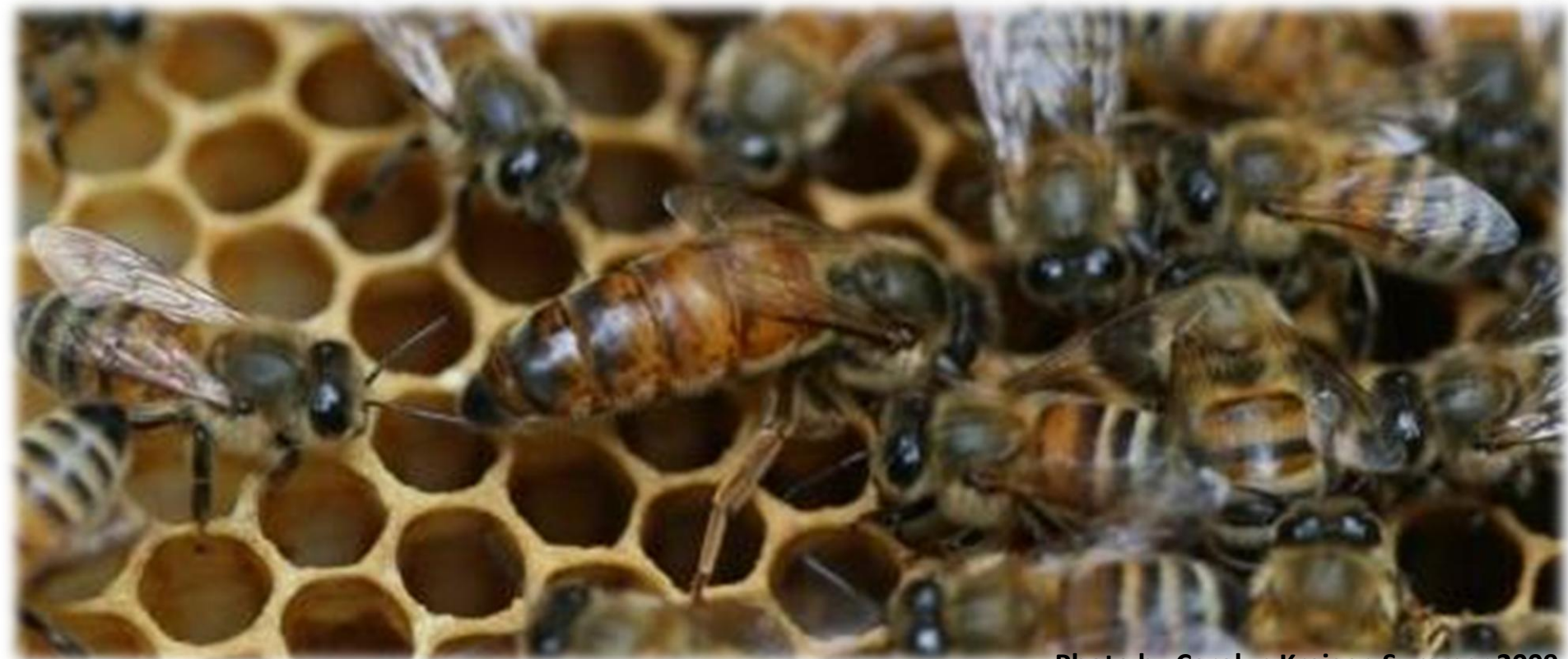
Summer 2009

Indiana Beekeepers Association Annual Fall Conference November 6-7, 2009